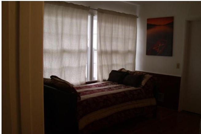
Guest Room One