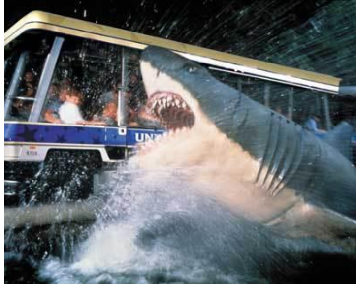
Universal Studios Hollywood (20 minutes from our home)