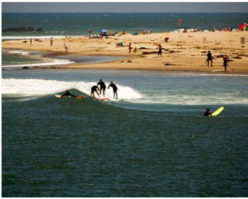
Malibu Beach (20 minutes from our home)