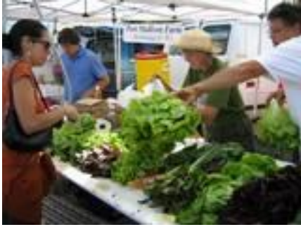
The Farmers Market in Hollywood (10 minutes from our