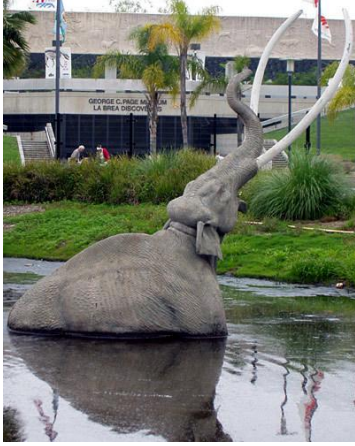
La Brea Tar Pitts (15 minutes from our home)