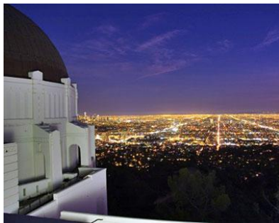
Griffith Park Observatory (20 minutes from our home)