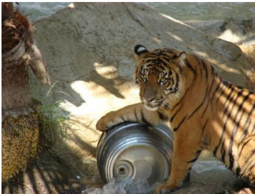
The Los Angeles Zoo (20 minutes from our home)