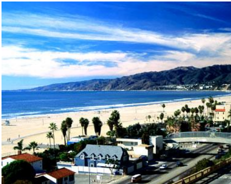
Santa Monica Beach (10 minutes from our home)