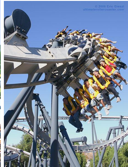
Six Flags Magic Mountain (30 minutes from our home)