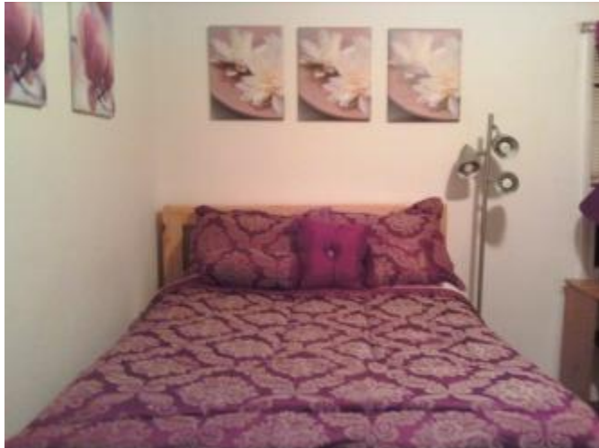
Guest Room Two