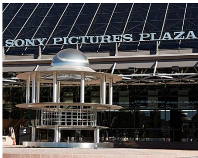
Sony Pictures Studios (10 minutes from our home)